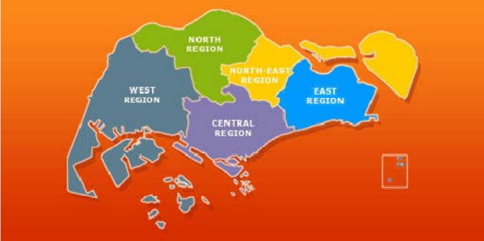
Figure 2: Geographical Map of the Five Planning Regions in Singapore